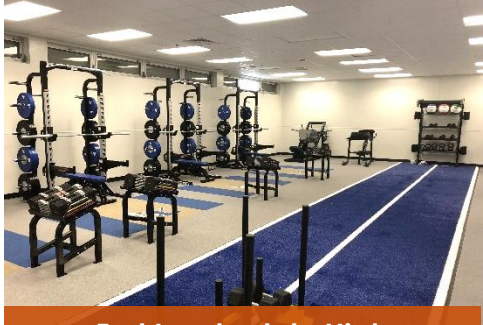
Fort Lauderdale High